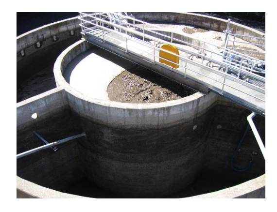
Wastewater treatment plants are among the facilities that need National Pollutant Discharge Elimination System Permits.

Some water quality permits have not been renewed since the 1980s, although most are substantially more recent. When a river or stream is not meeting water quality standards, and permits have not been renewed, the permits are still valid, but a facility can't be modified or expanded until the permit is formally renewed. More importantly, under these circumstances, wastewater discharges from new facilities can be extremely difficult if not impossible to allow. As the permit renewal backlog grows, it becomes both an economic and an environmental problem – with new clean water standards not addressed and economic development opportunities stifled.